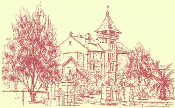
Holy Cross College, founded by the Patrician Brothers, 1891